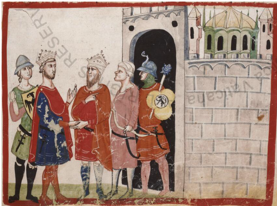
Frederick II Hohenstaufen and the Ayyūbid Sultan al-Malik al-Kāmil agree to the peaceful surrender of Jerusalem (1229), Source: Vatican Library, Chig.L.VIII.296, fol. 75r.

25 October / 31 October / 8 November 2024