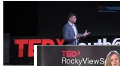
TEDx Talks ✓