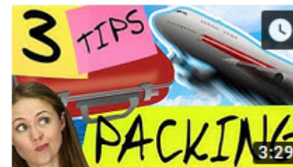
3 Tips to Make Packing for a Trip Less Stressful