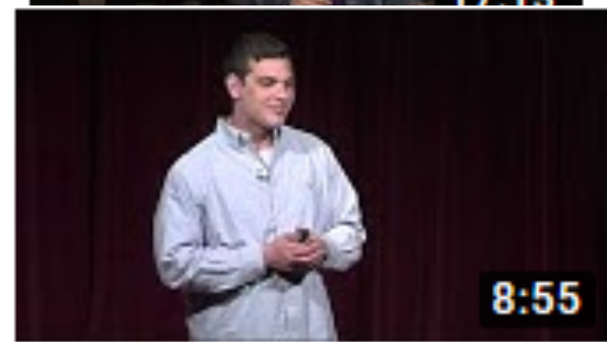
Living with ADHD in the age of information and social media | TEDx Talks TEDx Talks ✓ 313.470 Aufrufe