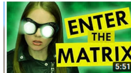
How to Prioritize When You Have ADHD: The Matrix