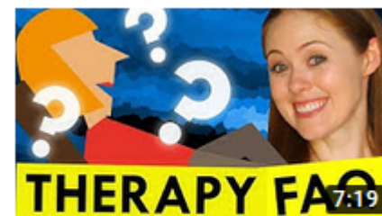
Therapy for ADHD? What to Look For, What to Expect