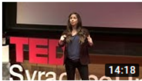
The Trouble with Normal: My ADHD the Zeitgeist TEDx Talks ✓ 126.656 Aufrufe