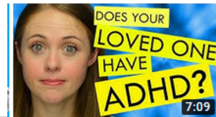
How to Help Someone who has ADHD