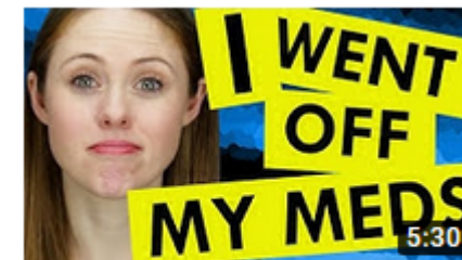
What Happened When I Stopped Taking My