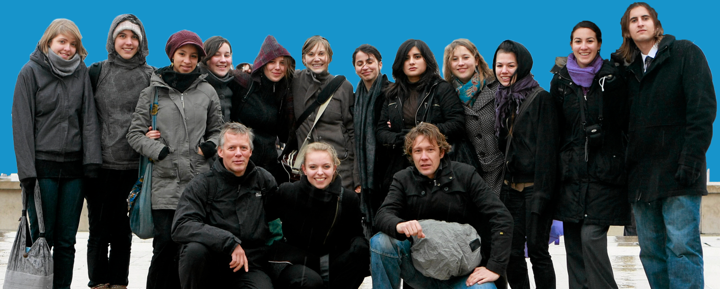
the NPT TV team